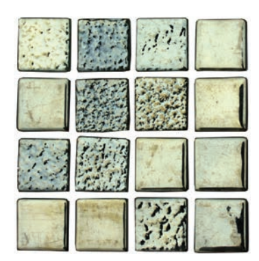
Rock Platino 50% *