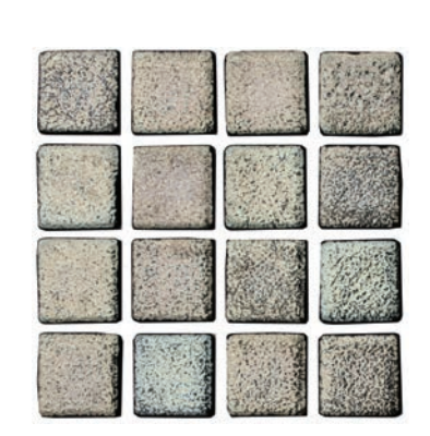
Metalica Plata *