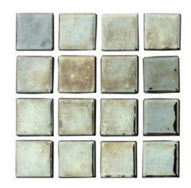
Metalica Platino *