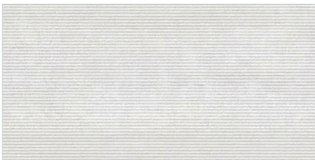
Blanco Décor 45x90cm