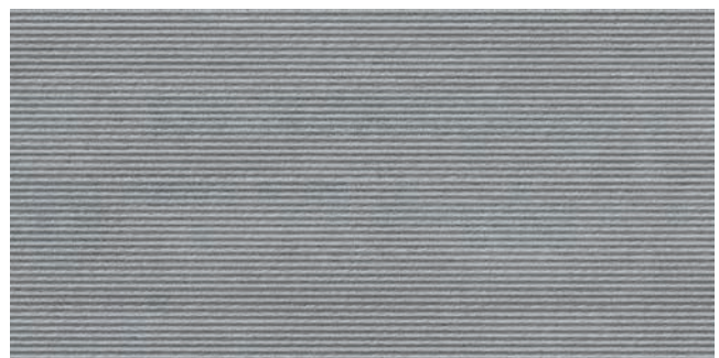
Gris Décor 45x90cm