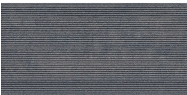
Marengo Décor 45x90cm