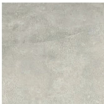
Cement Matt 100x100cm Rectified