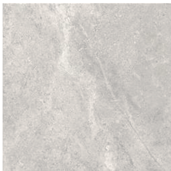
Pearl Matt 100x100cm Rectified