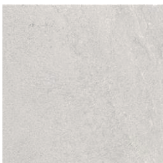
Soft Grey Satin 100x100cm Rectified