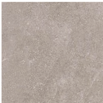
Natural Matt 100x100cm Rectified