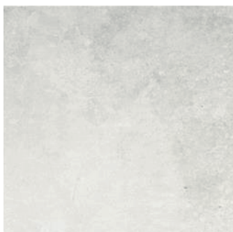
Blanco Matt 100x100cm Rectified