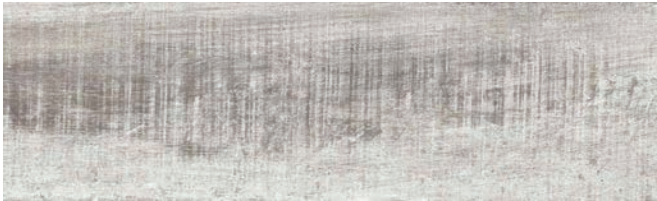
Gris Anti-Slip 20.2x66.2cm