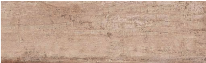
Natural Anti-Slip 20.2x66.2cm