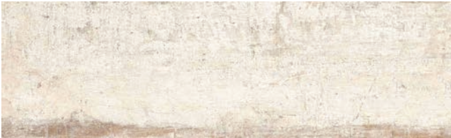
Miel Anti-Slip 20.2x66.2cm