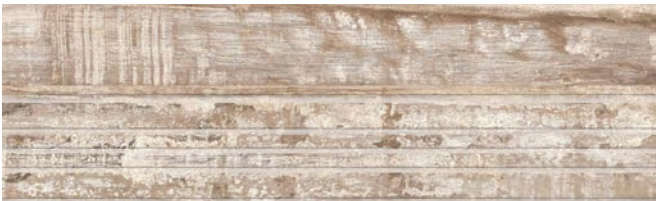
Miel Anti-Slip Step Edge* 20.2x66.2cm * Step Edge to order only