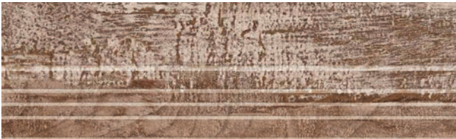
Natural Anti-Slip Step Edge* 20.2x66.2cm * Step Edge to order only