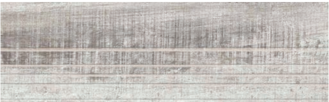
Gris Anti-Slip Step Edge* 20.2x66.2cm * Step Edge to order only