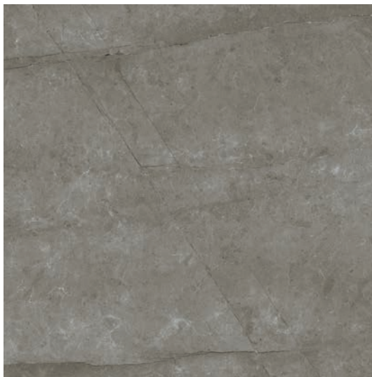
Gris Polished 75x75cm Rectified