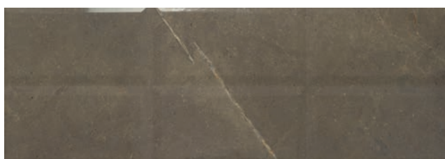
Natural Releive Décor 31.6x90cm