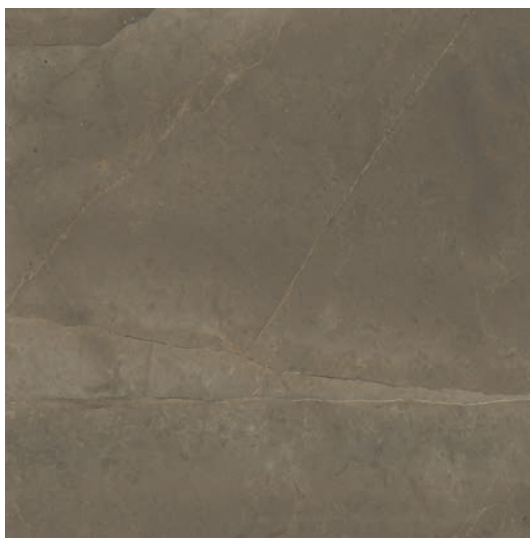
Natural Polished 75x75cm Rectified