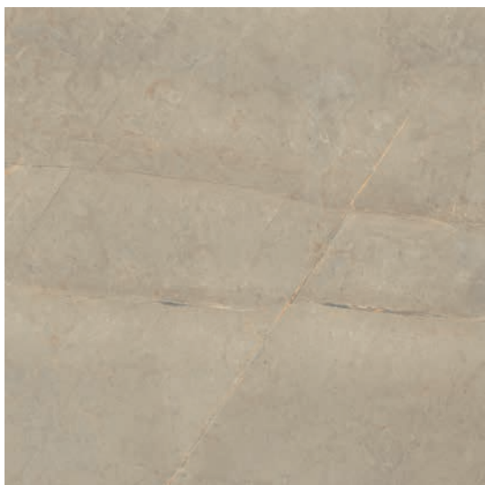
Crema Polished 75x75cm Rectified