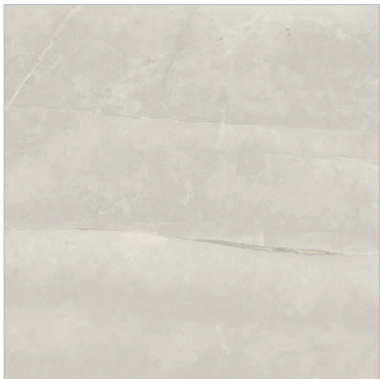
Blanco Polished 75x75cm Rectified