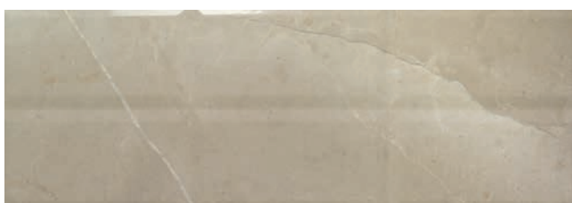
Crema Releive Décor 31.6x90cm