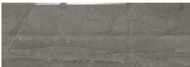
Gris Releive Décor 31.6x90cm