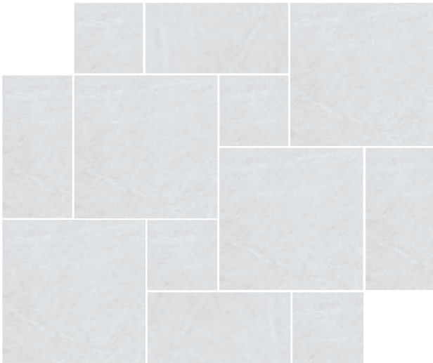
Blanco Modular Pack