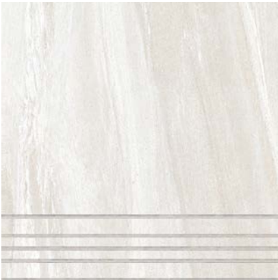
Blanco Anti-Slip Step Edge* 45x45cm * Step Edge to order only