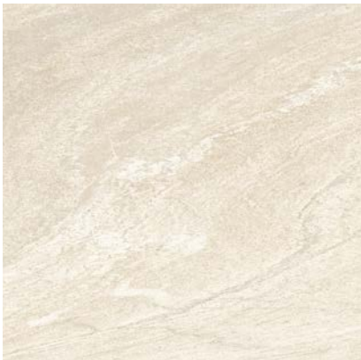
Crema Anti-Slip 45x45cm