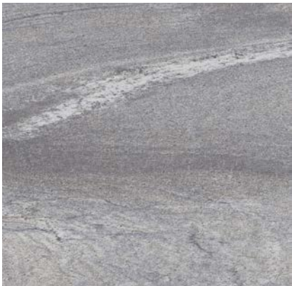
Gris Anti-Slip 45x45cm