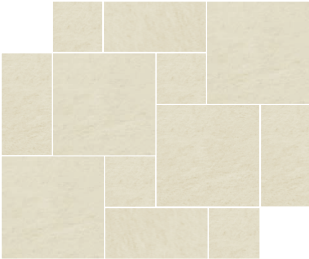
Crema Modular Pack