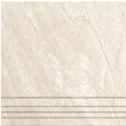
Crema Anti-Slip Step Edge* 45x45cm * Step Edge to order only