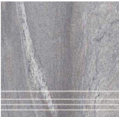
Gris Anti-Slip Step Edge* 45x45cm * Step Edge to order only