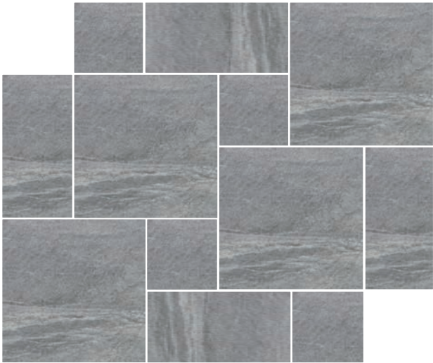
Gris Modular Pack