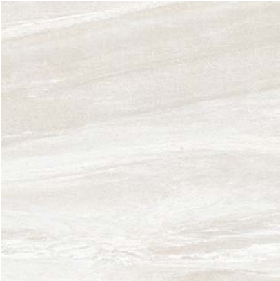
Blanco Anti-Slip 45x45cm