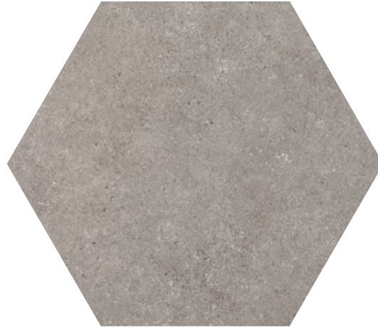
Grey 25cm Hexagonal