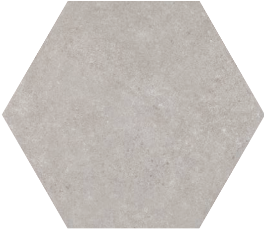
Silver 25cm Hexagonal