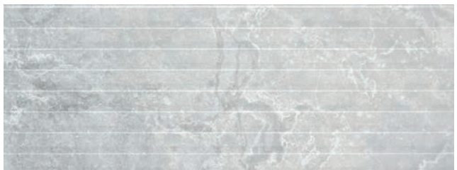
Grey Decor 33.3x90cm Rectified