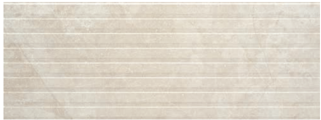
Cream Decor 33.3x90cm Rectified