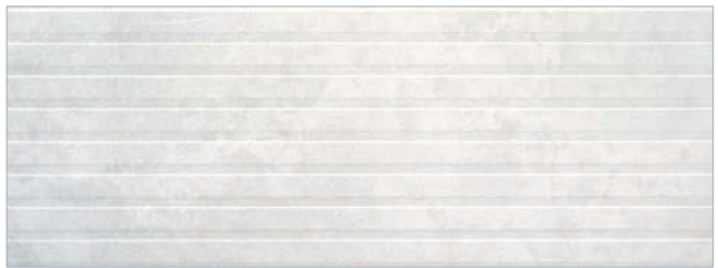
Pearl Decor 33.3x90cm Rectified