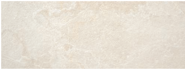
Cream 33.3x90cm Rectified