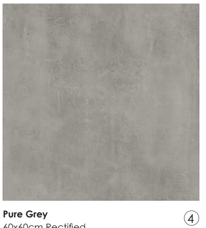
Pure Grey 60x60cm Rectified