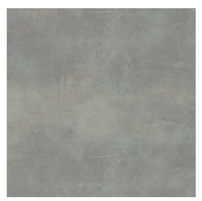
Grey 60x60cm Rectified