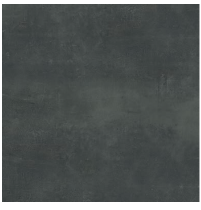
Graphite 60x60cm Rectified 4